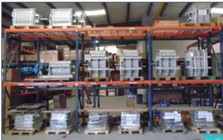
Rotary Valves, Double Dump Valves, and Isolation Gates