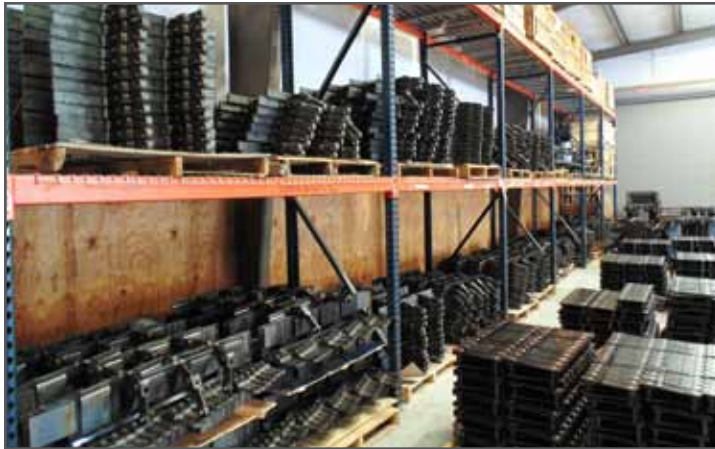
Drag Chain - Full line of 142mm Forged and Welded Series