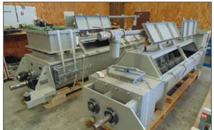
Ash Conditioners, Paddle Screws and Spray Nozzles