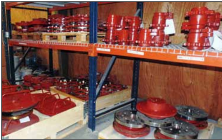
Sprockets and Hubs - Drag Chain, Shear Pin, Roller Chain, Submerged Idler, and Specialty Design